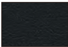
Eco Leather Midnight (P) FC-11