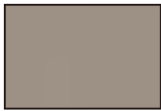
Eco Leather Dusk (P) FC-08