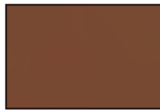
Eco leather Cognac (P) FC-13