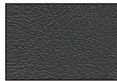
Leather Ink (R) RS-32