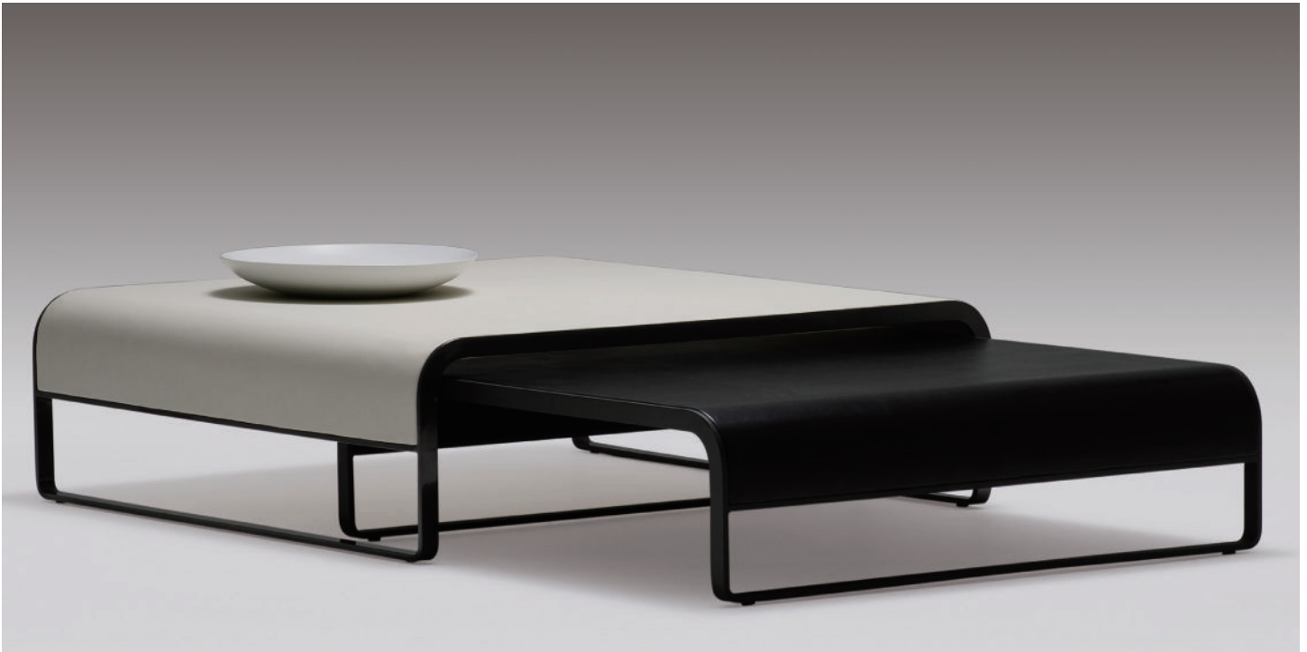
ERA / FRAME: Black fluorocarbon painted steel. TOP: Curved plywood top wrapped in P/FC or R/RS leather.